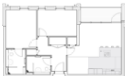
Wintergreen Court Ground Floor: Apartment 3 First Floor: Apartment 5 Second Floor: Apartment 16