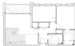
Wintergreen Court First Floor: Apartment 6 Second Floor: Apartment 17