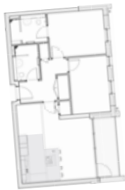
Wintergreen Court First Floor: Apartment 8