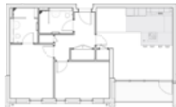
Wintergreen Court Ground Floor: Apartment 4 First Floor: Apartment 13 Second Floor: Apartment 19